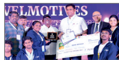
Secured First Place in the prestigious Smart India Hackathon (SIH) 2025, along with a cash prize of ₹75,000