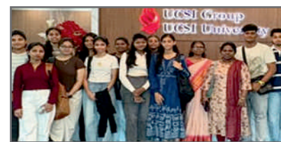
Our students successfully completed a prestigious internship at UCSI University, Malaysia