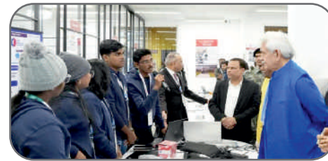
Our Third Year CSBS Students participated in the Grand Finale of SIH 2024 & presented their project to the Lieutenant Governor Shri. Manoj Sinha